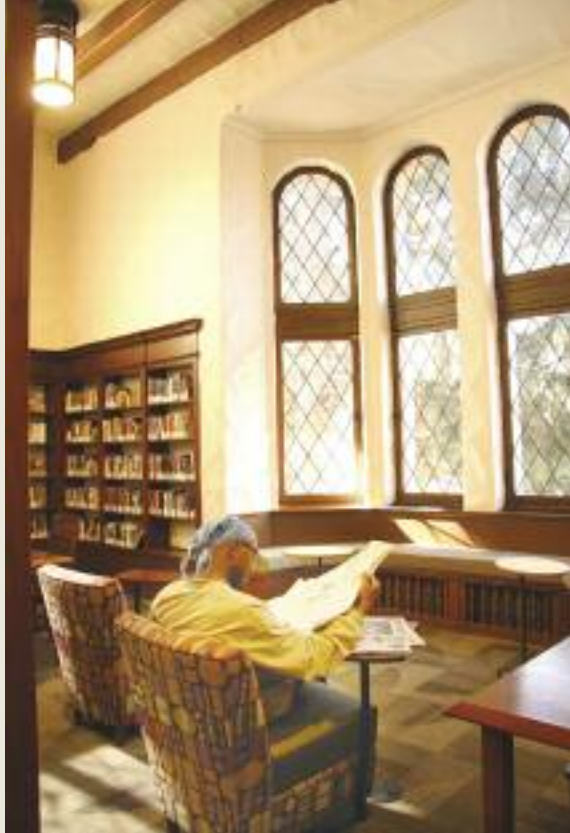
Robert Jones catches up on the newspaper in new easy chairs in front of the big bay window in the adult section.

community with the project needs, constraints and goals of all key stakeholders.