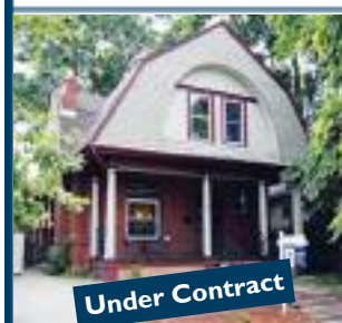
1575 Franklin St. - $339,500