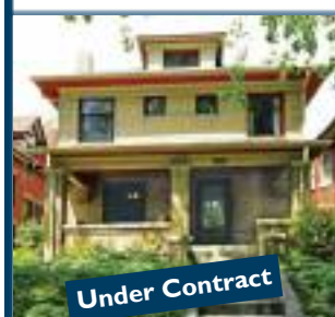
1555 Cook St. - $550,000

URGENT! Almost All of my houses are SOLD or UNDER CONTRACT... I would love to sell yours next!