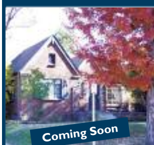
1680 Niagara St. - Coming Soon