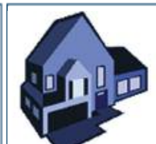
Reserved for Your Home!

URGENT! Almost All of my houses are SOLD or UNDER CONTRACT... I would love to sell yours next!