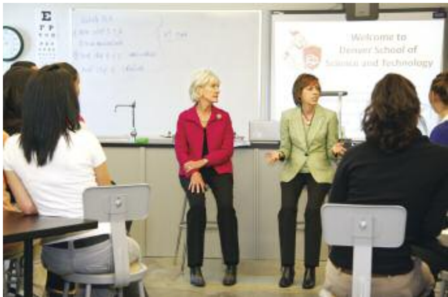
Health and Human Services Secretary Kathleen Sebelius and NASA astronaut Ellen Ochoa visited a classroom at the Denver School of Science and Technology at Stapleton as part of the First Lady’s mentoring program.

Kathleen Sebelius, Health and Human Services Secretary, and Dr. Ellen Ochoa, astronaut and first Hispanic woman in space, visited the Denver School of Science and Technology (DSST) on November 16 as part of First Lady Michelle Obama’s national leadership and mentoring initiative for young women.