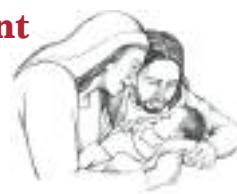
The Miracle of Christmas

Come spend Advent & Christmas with us at St. Matthew Lutheran Church