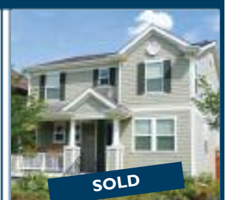
2806 Emporia St. - SOLD!