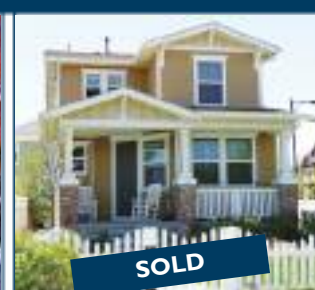
2851 Alton St. - SOLD!