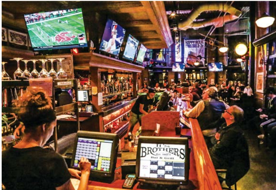
Local fans enjoy college games at It's Brothers Bar in The Shops at Northfield. Brothers offers most college conferences, except Pac-12, on a huge array of big screen TVs.